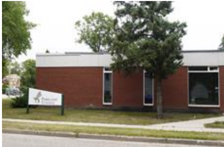
Canora (41 mnts)