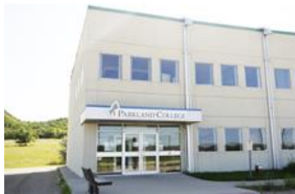
Fort Qu'Appelle (1 h 27 mnts)