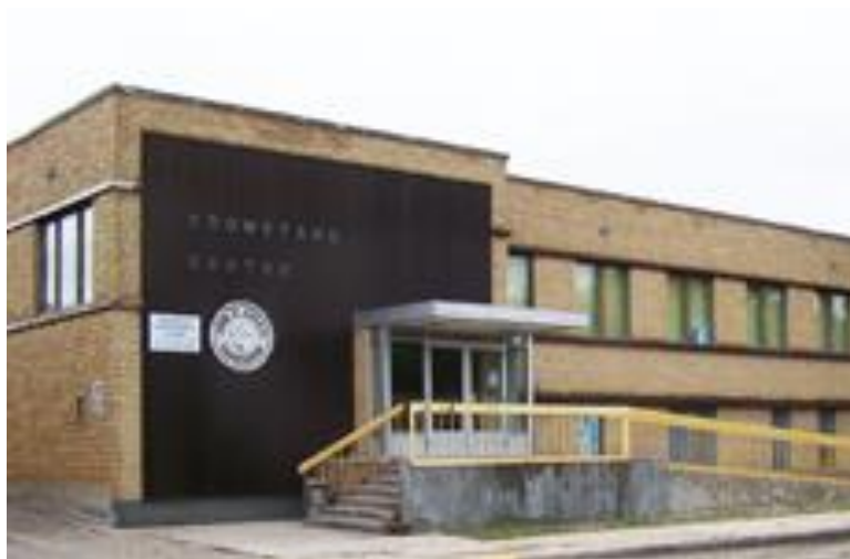
Kampsack (1 h 8 mnts)