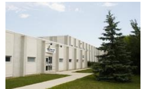
Melville (34 mnts)