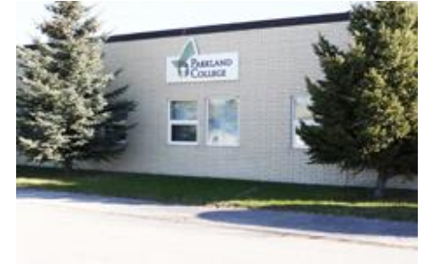
Esterhazy (1 h 11 mnts)