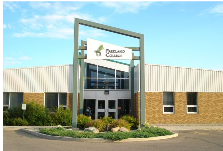
Yorkton Main Campus